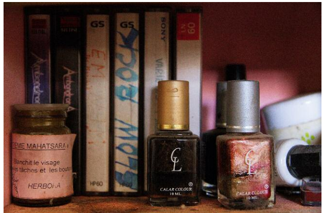
press image 10 © MALALA ANDRIALAVIDRAZANA