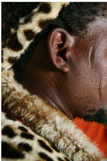
press image 3