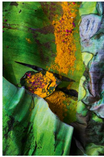
press image 4 © MALALA ANDRIALAVIDRAZANA