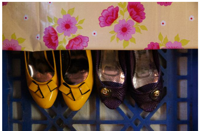
press image 6 © MALALA ANDRIALAVIDRAZANA