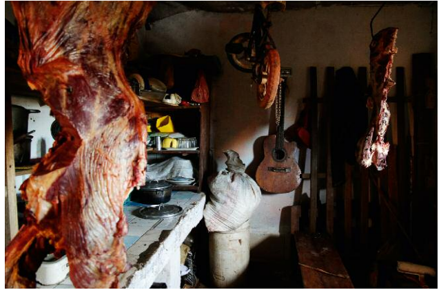
press image 8