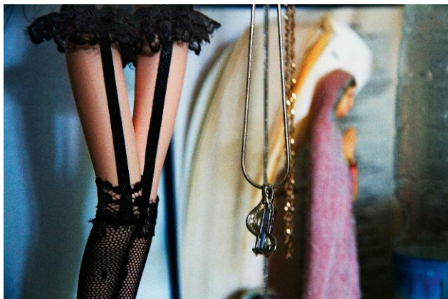
press image 5 © MALALA ANDRIALAVIDRAZANA