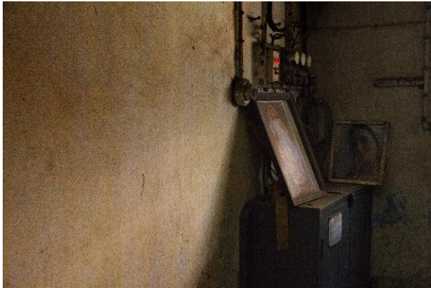
press image 1 © MALALA ANDRIALAVIDRAZANA