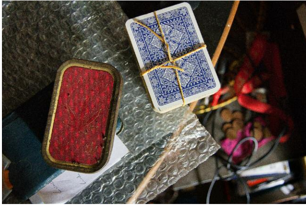
press image 7